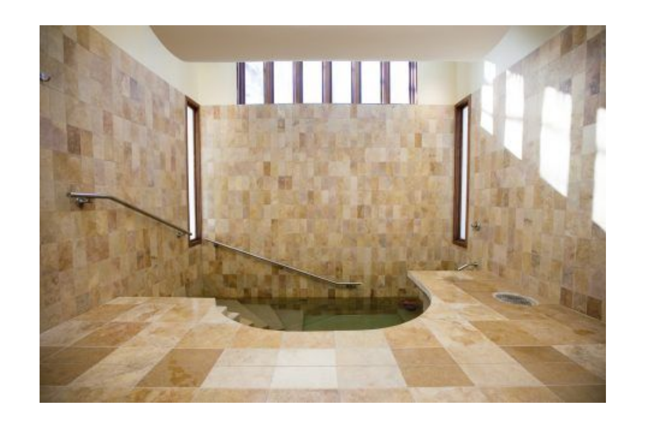
The Mikveh room will look like this.