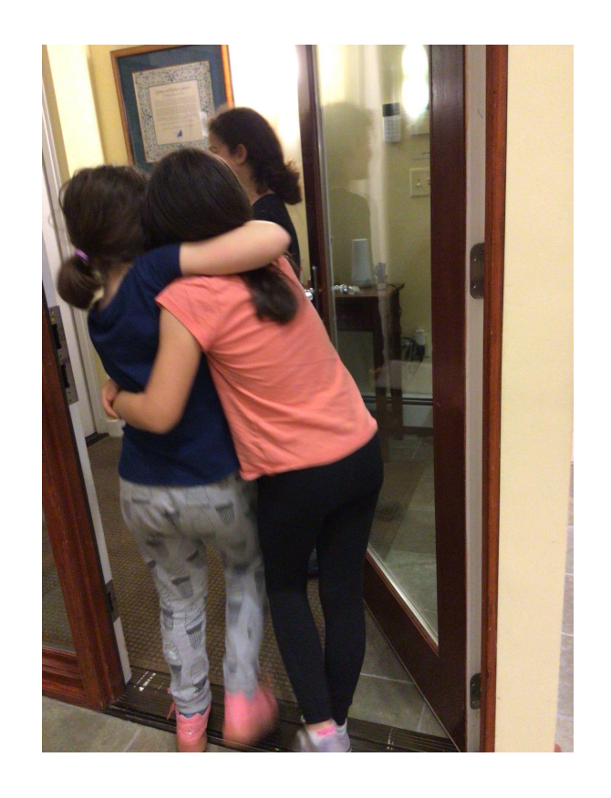
Now we will leave the mikveh together. What a great day!